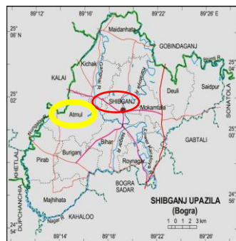
Figure 2. Map of Shibganj upazila showing the study area

Shibganj upazila (sub-district) covers an area of 315.92 sq. km, located in between 24°55' and 25°07' north latitudes and in between 89°11' and 89°28' east longitudes. It is bounded by gobindaganj (gaibandha) upazila on the north, bogra sadar, kahaloo and dupchanchia upazilas on the south, sonatola and gabtali upazilas on the east, kalai and khetlal upazilas on the west (Banglapedia, 2021). The climate of this area is warm and temperate. In winter, much less rainfall is experienced in Bogra than in summer. The average temperature is 24.8 °C and the precipitation is about 2060 mm (BMD, 2021).