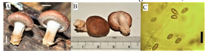
Figure 2. A. Field Photo B. Close-up Photo C. Basidiospores (Scale Bar: A= 5cm; B = 2cm; C = 10µm)

Basidioma generally light coloured to reddish brown or black. Cap 4.5 - 25 cm across, dark black when young, changing to reddish brown, vinaceous brown or black with age, hemispheric, expanding to convex to nearly flat at maturity and covered with white specs. Gills even at first, serrated after age, whitish, occasionally developing reddish brown spots. Stipe central to eccentric; 2.5-5.5 cm long; fibrous, tough. Veil absent, mycelium creamy white to white at first, becoming longitudinally linear and cottony-aerial in age, rarely rhizomorphic. With age or in response to damage, the mycelium becomes dark to dark brown. Spore print pure white to buff. Spores 5.5 - 6.5 x 3 - 3.5µm; ovoid to oblong ellipsoid, hyaline, inamyloid, smooth.